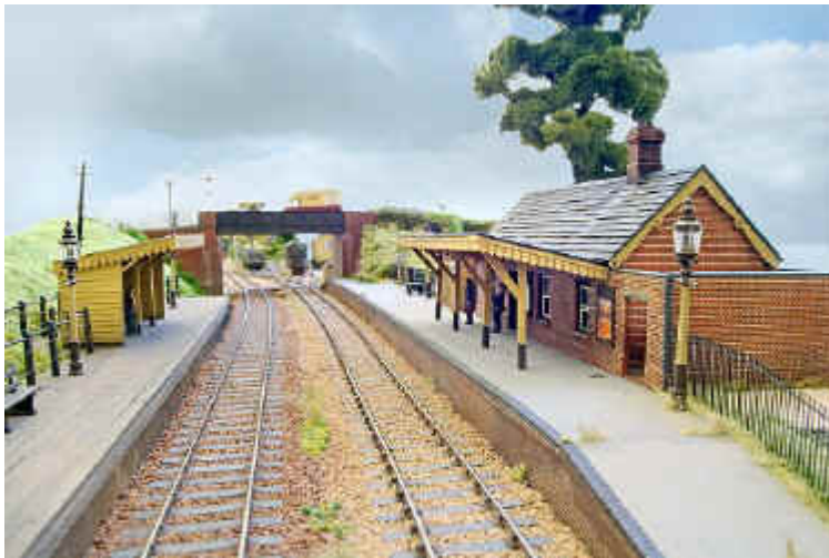
General view of the station.