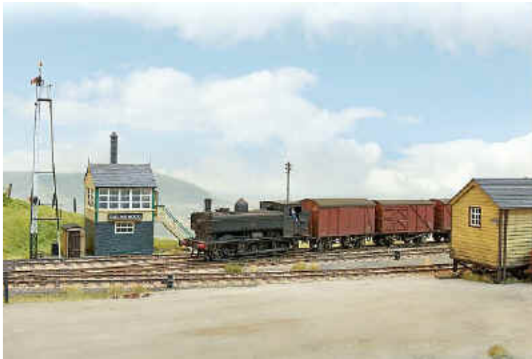
A pannier tank loco arrives at Engine Wood with an up goods train.