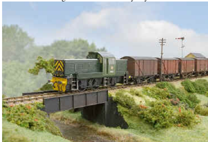
A class 14 diesel-hydraulic approaches Engine Wood with an up van train.