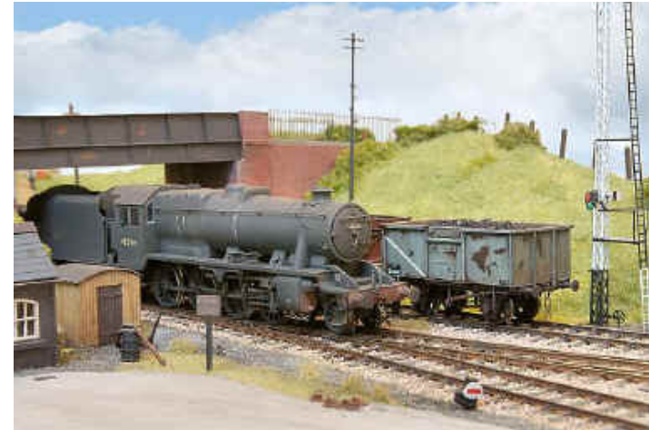
48706 shunts a coal train.

Hymek D7039 has arrived from Bristol and has been shunted to wait outside the Down Home signal for the NCB loco to finish positioning a rake of loaded mineral wagons for onwards transit to Portishead Power Station