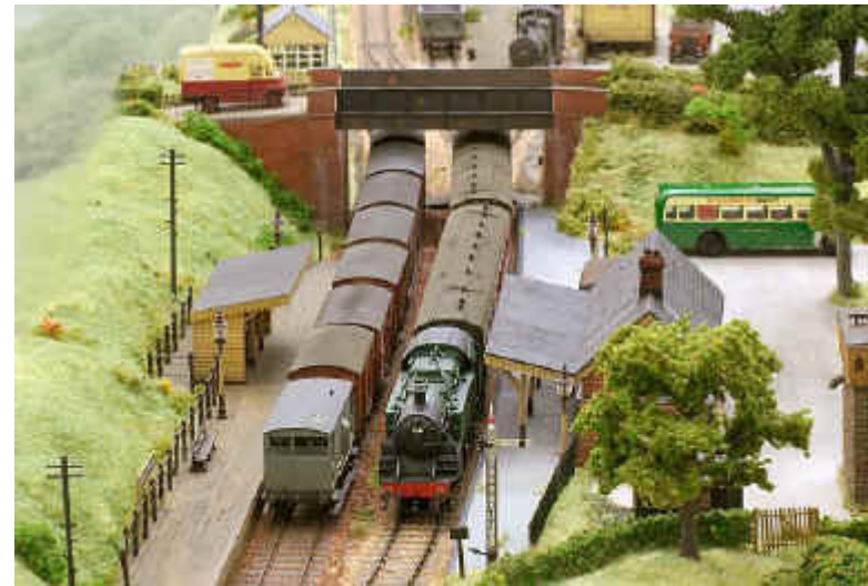
Trains crossing at Engine Wood, whilst 44422 waits in the yard.