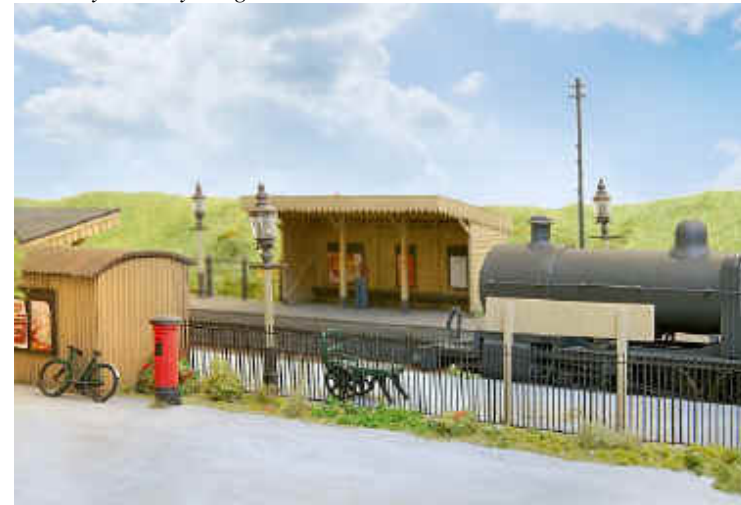
53804 arrives at Engine Wood with an up goods.