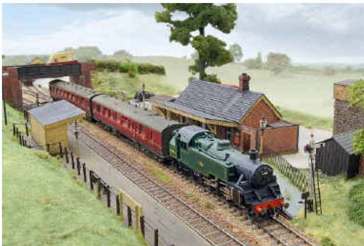
82041 awaits the signal with an up passenger train from Evercreech Jct to Bristol TM.