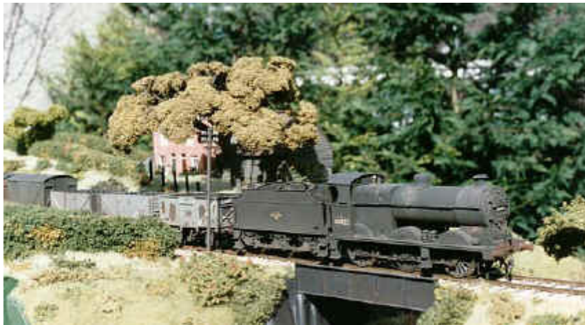
44422 crossing the Cam Brook on the extended part of the layout. The scenic section used to end where the tender and the first mineral wagon are coupled. The photo was taken in the garden on a nice sunny day.