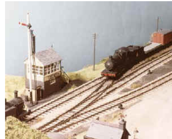
'Collett Goods' 0-6-0 No. 2291 arrives at Engine Wood with a down pick-up goods train. Waiting at the Up Starting signal is Jinty 47316. 2291 will now proceed to shunt the yard before continuing on to do the same at Camerton and other stations to Bristol