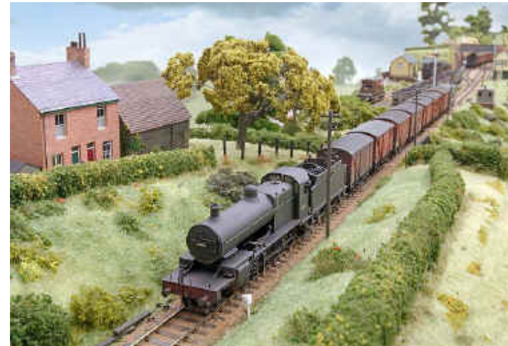
53804 departs with the Avonmouth to Blandford fertiliser van train.