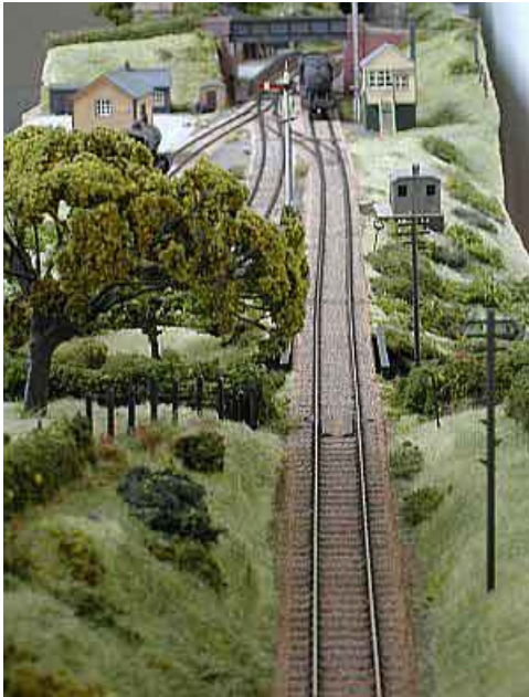
Aerial views of the layout from either end