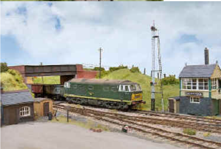
A Hymek-hauled coal train pauses at Engine Wood.