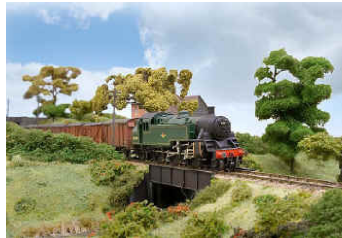
A very clean 82041 runs over the Cam brook with an up van train.