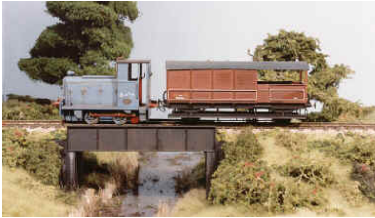
The NCB loco 'Buntie' and brake van pose on the river bridge over the Cam Brook. This was technically outside the limit of permitted operation for the NCB engine. The loco is a Barclay design and was scratchbuilt by Brian Clarke.