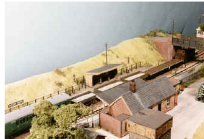
Jinty 47316 slowly plods through the station with an engineer's train from Bristol to Radstock prior to some weekend work