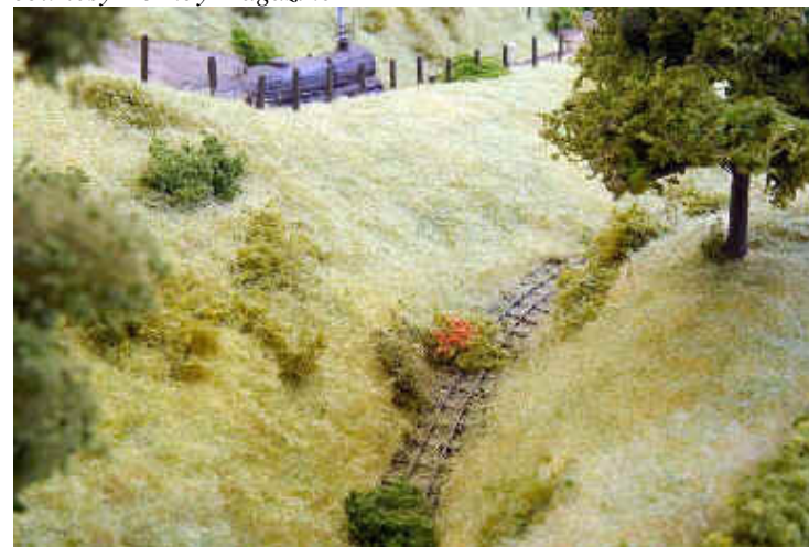
The remains of the 15" gauge Engine Wood Colliery Tramway.