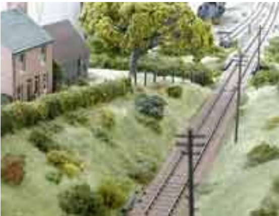
Two views of the Midford Junction end of the layout, where the single line goes into a cutting and disappears under the bridge carrying the lane to Combe Hay