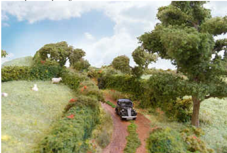
The lane above Engine Wood tunnel.